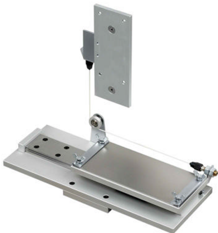
(P90-200N table set)